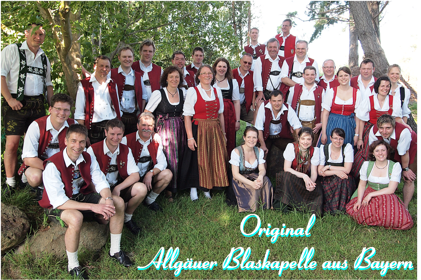
Original Allgäuer Blaskapelle aus Bayern