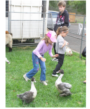
See those wild kids!