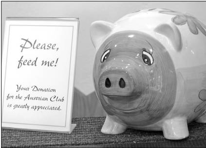
This is the Club's new mascot - the little "Sparschweinchen". When you see it at the reception desk sometimes, don't be afraid of it! It's quite tame and friendly - especially when you put some money in its back. So please be kind to it and feed it!