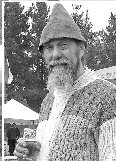
ABOVE: The mystery man, only known by his pseudo name "Rübezahl", having a quiet drink.