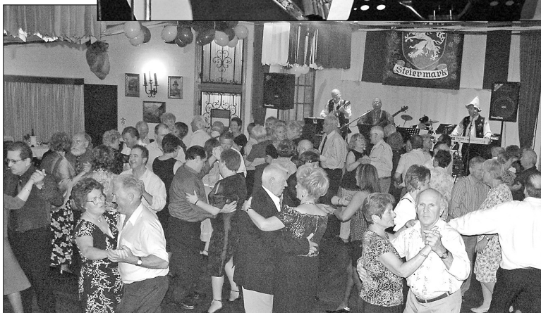
Full house at the 2006 Steirer Abend